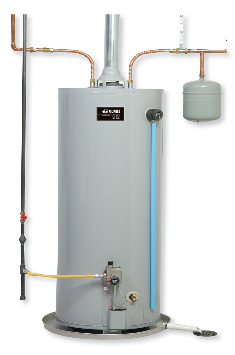
This Reliance gas water heater was installed using Fittings, Flexible Water Connectors, a Flexible Gas Connector, a T&P Valve Discharge Pipe, an Aluminum Drain Pan and an Expansion Tank, all of which are included in this catalog.

Our mission is to make it easy for you to sell Reliance water heaters, and easy for your customers to install and maintain them. Any time you have a question or problem, you can speak to a Reliance Customer Assistance Representative by calling 1-800-365-7782.